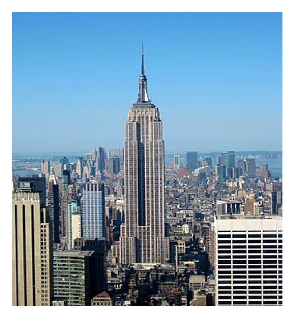
<u>made by the 3, 400 workers (European and Mohawks) who didn't feel dizzy: the photographic testimony of</u> <u>Lewis W. Hine</u>