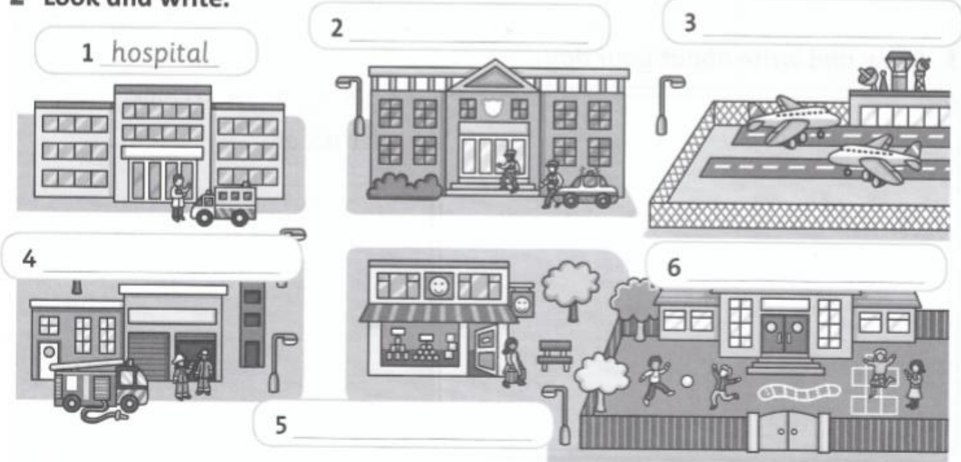
1 \rightarrow hospital • 2 \rightarrow police station • 3 \rightarrow airport • 4 \rightarrow fire station • 5 \rightarrow shop • 6 \rightarrow school.