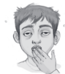
He is tired .