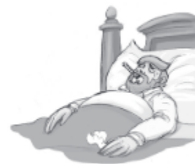
He is ill .