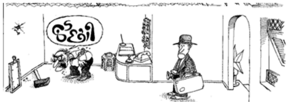
The Traveller (Quino)