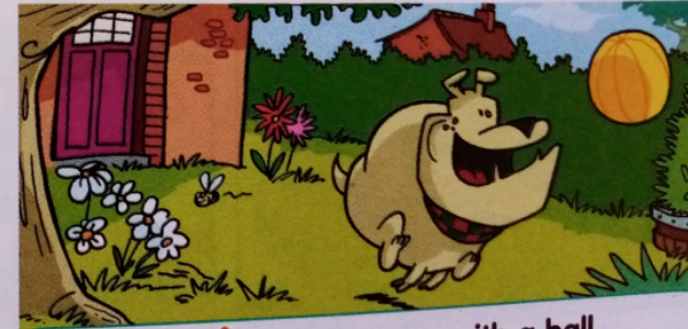
J u mbo is play i ng with a ball.