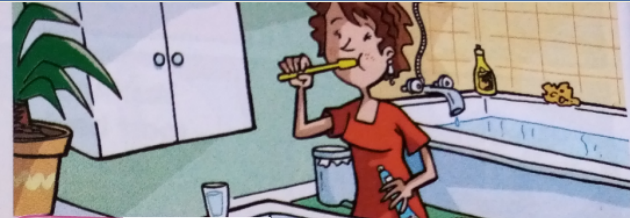
The _____ is _____ her _____