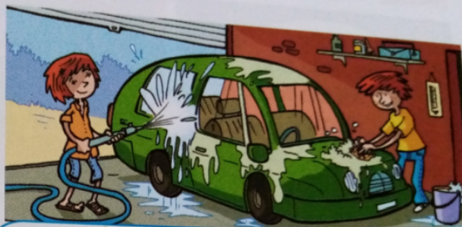
The _____ are _____ the car.