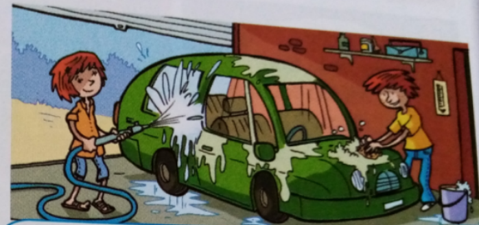
The children are washing the car.