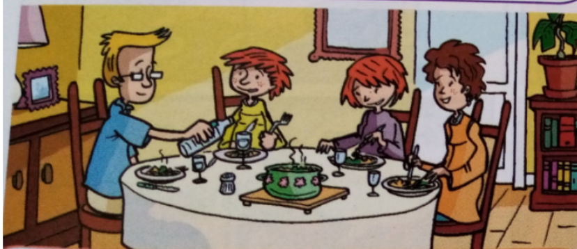
The _____ is _____ dinner.