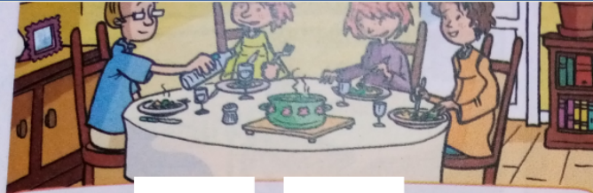
The _____ is _____ dinner.