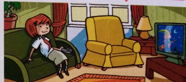
_____ is _____ television.