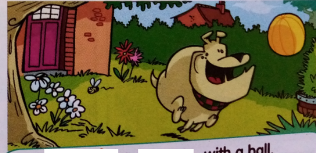
_____ is _____ with a ball.