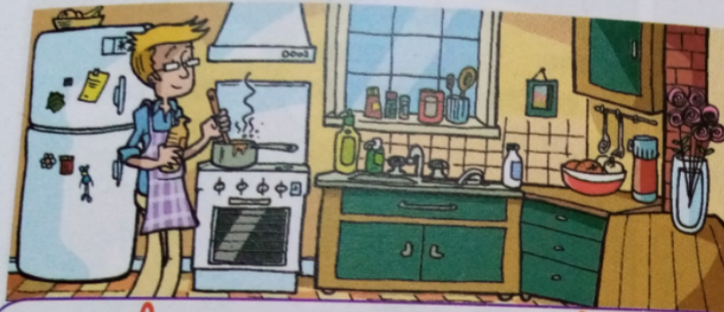
The father is cooking in the kitchen .