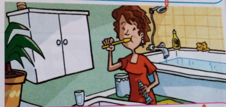
The mother is brushing her teeth .