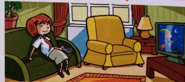
H o lly is watch i ng television.