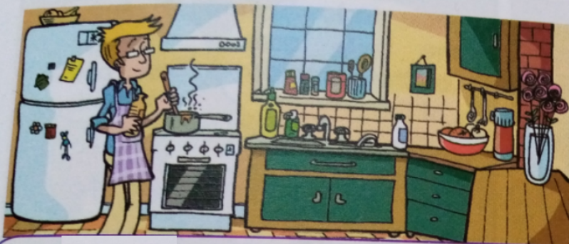
The _____ is cooking in the _____ .