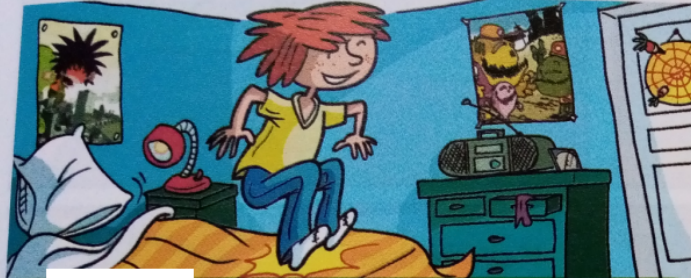
_____ is _____ on his _____