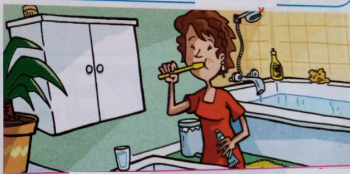
The _____ is _____ her _____