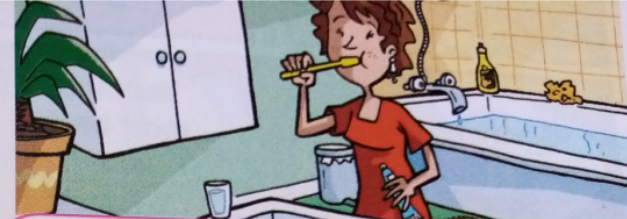
The m o ther is brush i ng her t e eth.