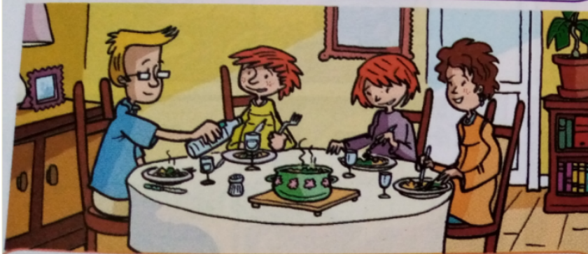
The family is eating dinner.