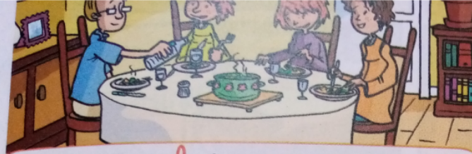
The f a mily is eat i ng dinner.