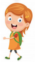
go to school