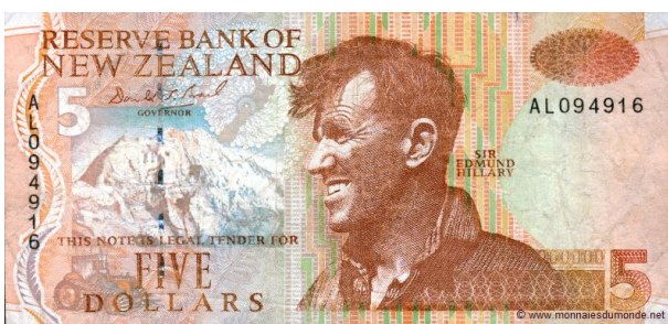
Sir Edmund Hillary

The currency used in New Zealand is the dollar ( at the moment 5,00 NZD = 2,73090 € ) On the five dollar note you can see Sir Edmund Hillary. He climbed the top of Mount Everest in 1953.