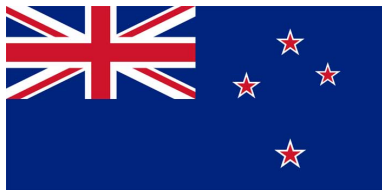
New Zealand flag's

There are two official languages in New Zealand: English and Maori. There are also two official flags :