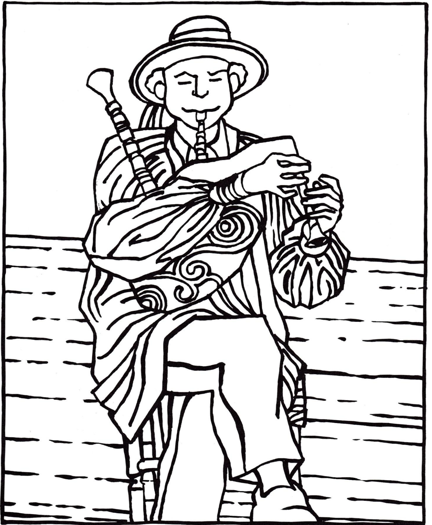
THE BAGPIPE PLAYER