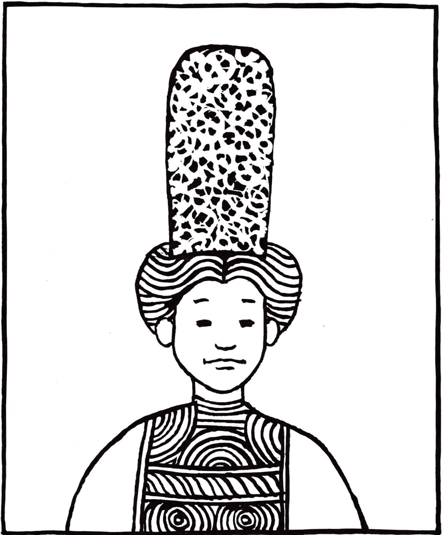
A WOMAN FROM BIGOUDEN (with her famous lace headdress)