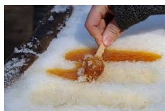
maple syrup on snow